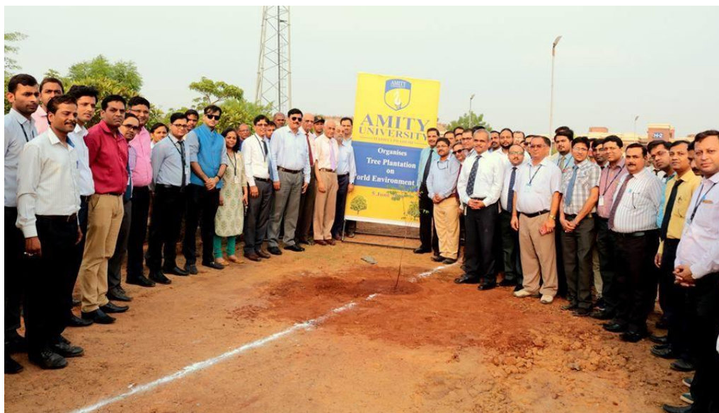
Tree Plantation by Eco-Club AUMP, on World Environment Day, June 2018